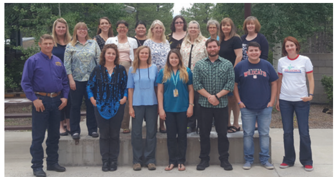
AZTransfer Facilitators at the 2017 annual training retreat in Flagstaff, AZ.