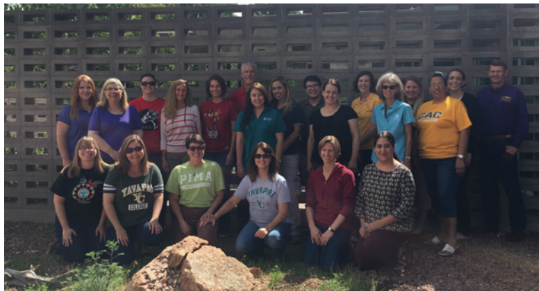
AZTransfer Facilitators at the 2016-2017 training retreat in Flagstaff, AZ