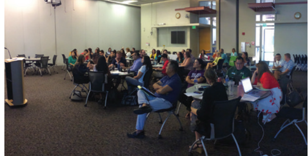
In July 2016, AZTransfer hosted a workshop for Arizona admissions and recruitment professionals that was attended by 47 representatives from across the state.